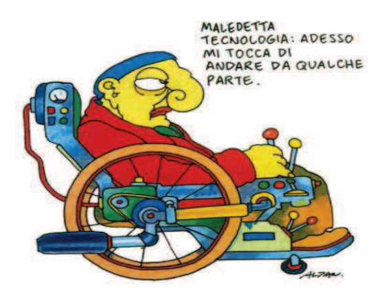
Damn technology! Now I have to go somewhere!